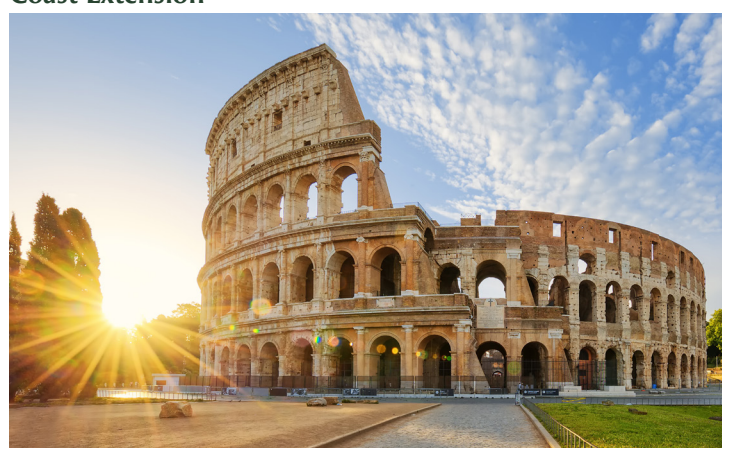
August 7 - Return Home or Enjoy the Optional Amalfi Coast Extension

Experience the glory of Christian Rome today as you visit the Vatican, home to one of the greatest museums in the world. And, of course, tour St. Peter's Basilica and the Sistine Chapel with Michelangelo's frescoes, now restored to their full, colorful glory. Tour the Catacombs of St. Sebastino and see some of the only surviving examples of early Christian art. In the 1840s, Pope Gregory XVI took steps to preserve the catacombs and their treasures. Visit the Basilica of St. Paul Outside the Walls, which stands over the place where Constantine built the first church (over St. Paul's grave), before returning to your hotel to begin packing for your return journey home.